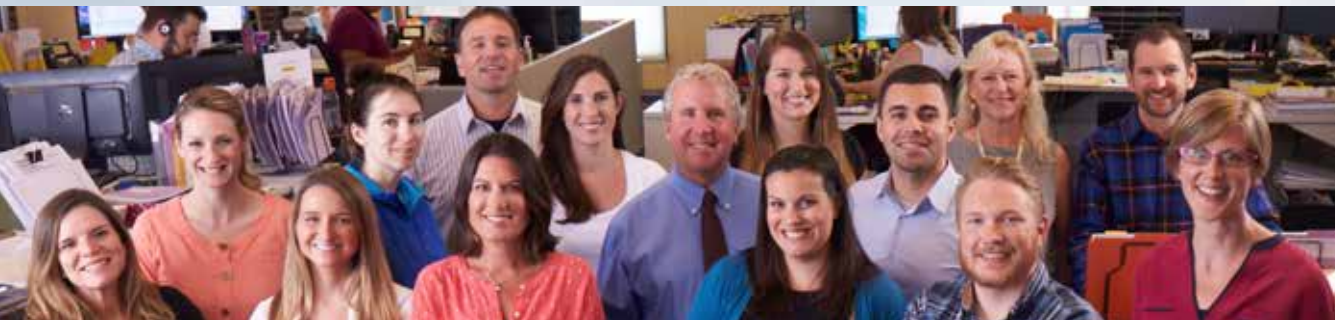
ABD's pharmacist team includes certified specialty pharmacists and brings decades of experience to patient care.

As a leader in specialty pharmacy, Apothecary By Design (ABD) has teamed with the University of New England to create one of the few specialty-focused PGY1 community pharmacy residencies in the country. A residency that allows you to gain extensive management and clinical experience, in every aspect of specialty pharmacy services. All in the vibrant, coastal city of Portland, Maine.